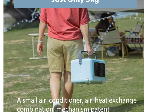
A small air conditioner, air heat exchange combination mechanism patent