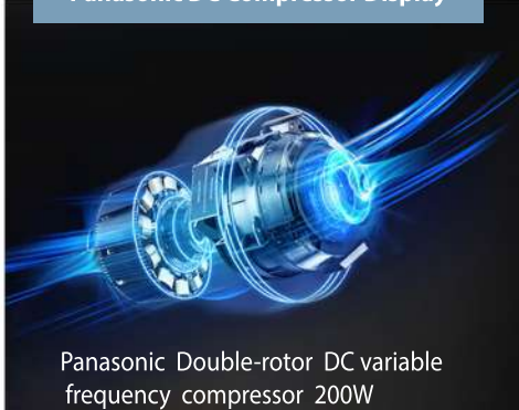
Panasonic Double-rotor DC variable frequency compressor 200W